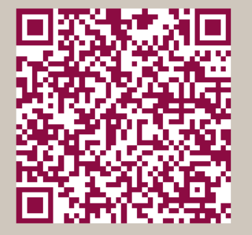
Photo the QR Code on the right that takes you right to the Registration Links (4 pages) and then you can copy and complete.

You will need your 2024 Signed Horse Certificate from the Extension Office WITH YOU in order to participate at the show!!