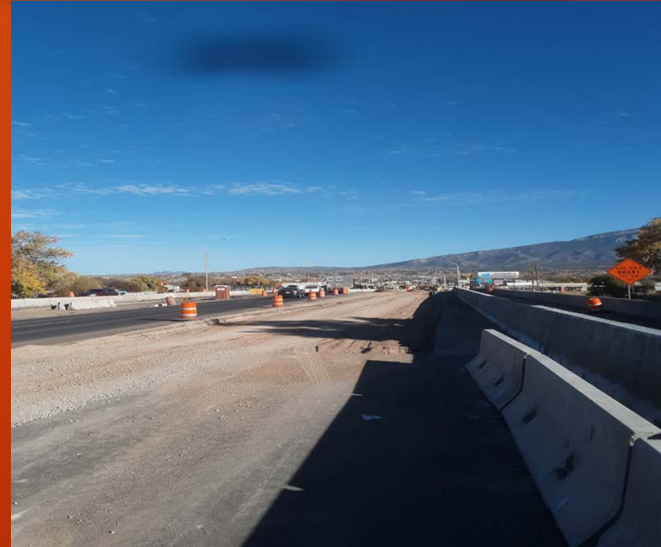
Pavement tie-in at River Bridge