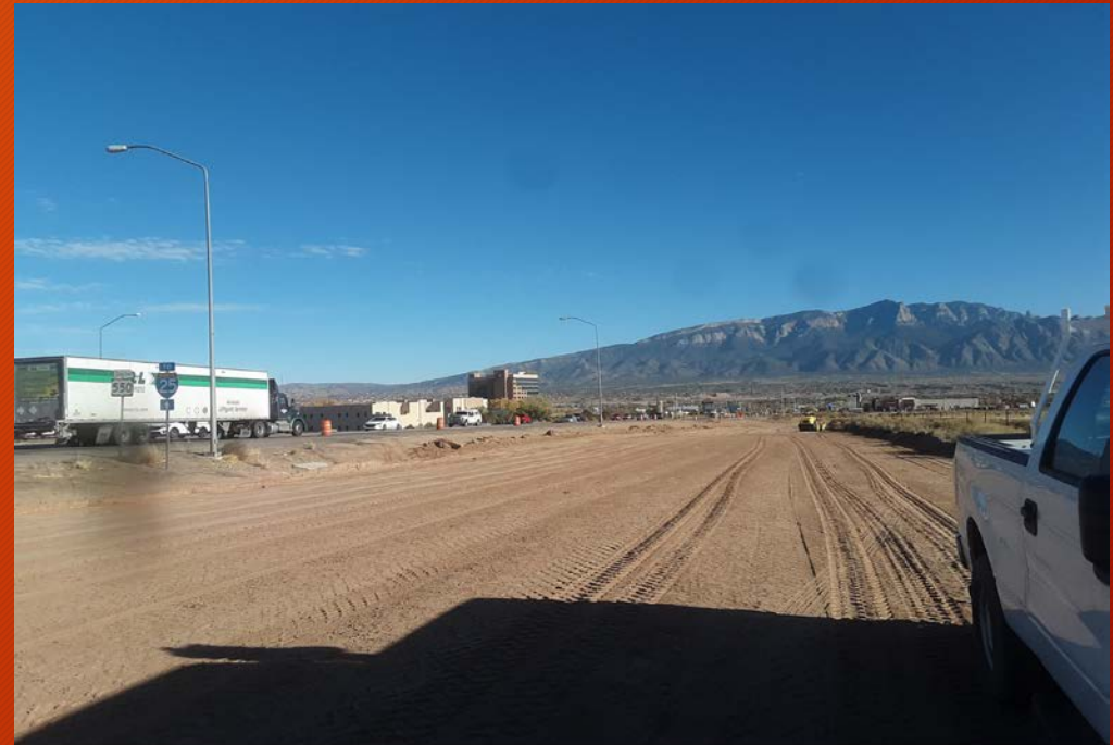
South East Quadrant NM528 Intersection

Work to be completed next phase West of Rio Grande River Build CFI (Continuous Flow Intersection) Build median and drainage features Provide street lighting and sidewalk