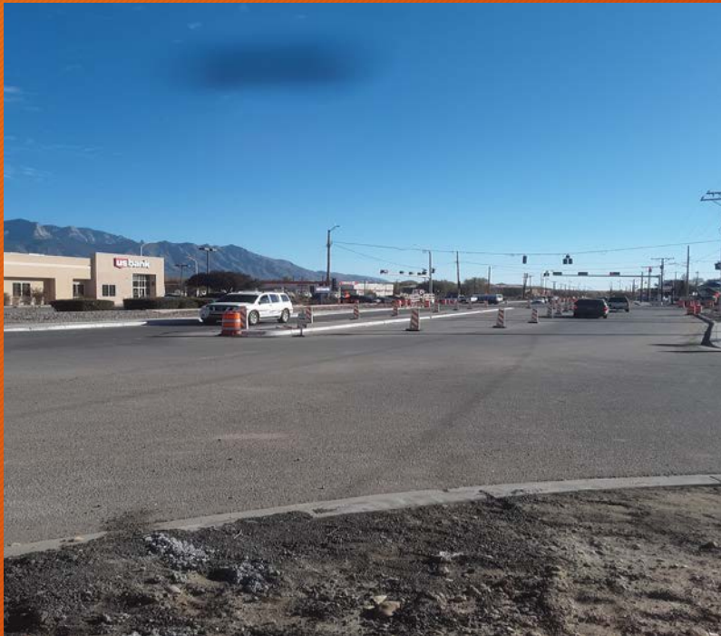
View of Don Tomas looking south